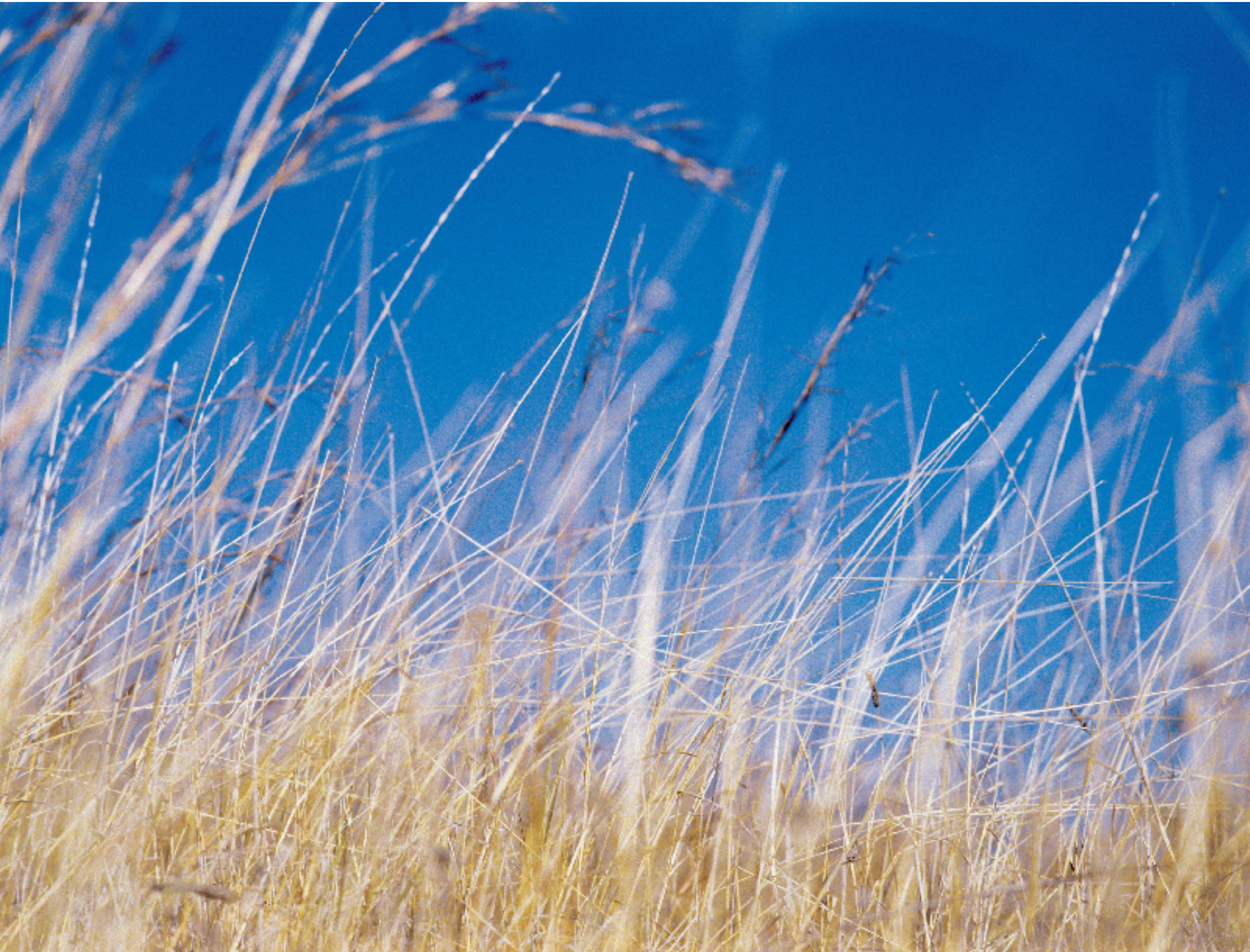
Untitled [long grass] from the series flyblown 1998 chromogenic pigment print National Gallery of Australia, Canberra