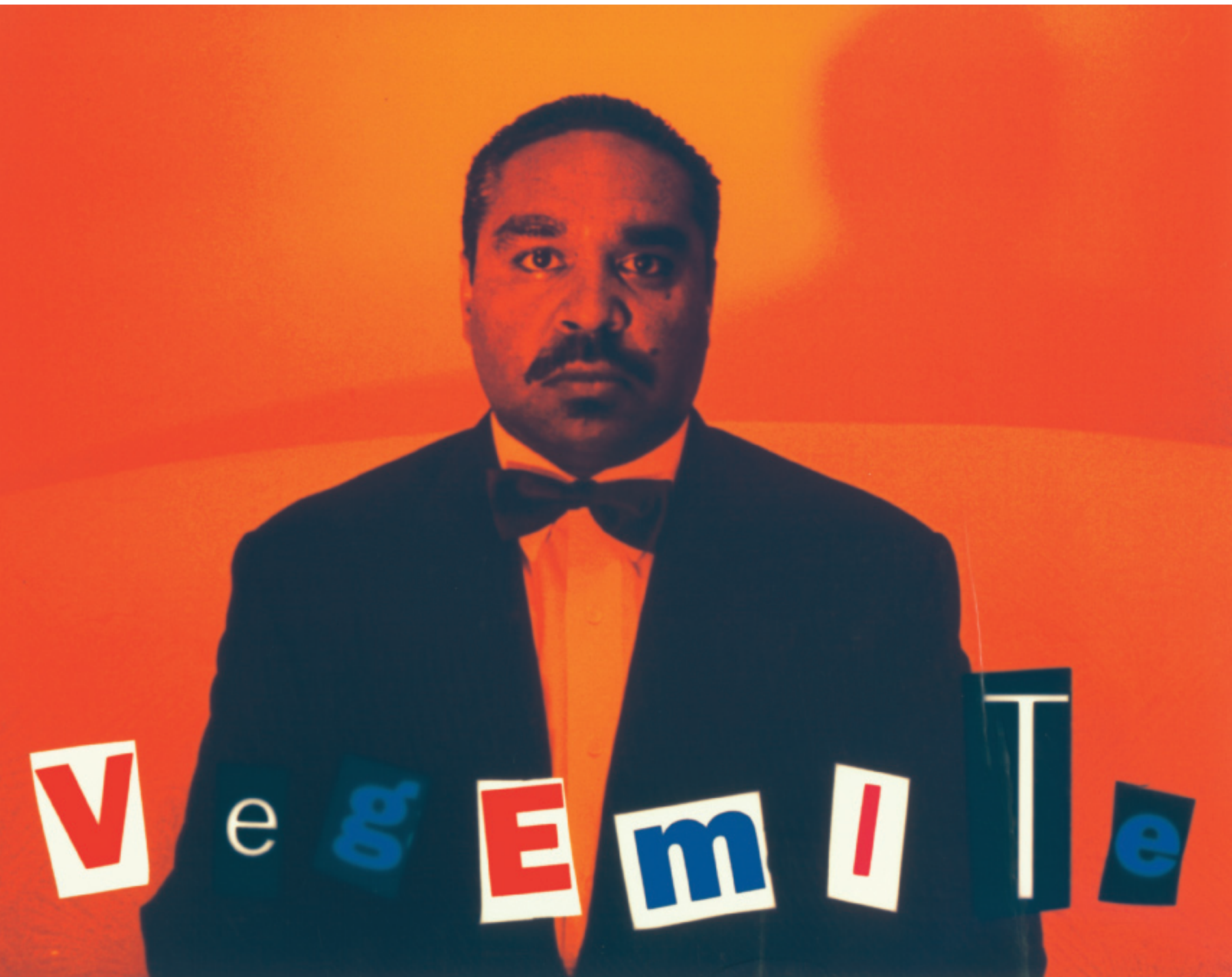
(above and opposite) They call me niigarr series 1995 collaged cibachrome photographs Boomalli Aboriginal Artists Co-operative Ltd